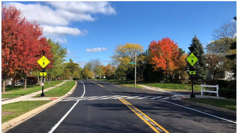
New flashing beacons at the main crosswalk by High Hill Park and Nature Preserve

At this time the contractor is working on punchlist items that need to be addressed or adjusted throughout the project.