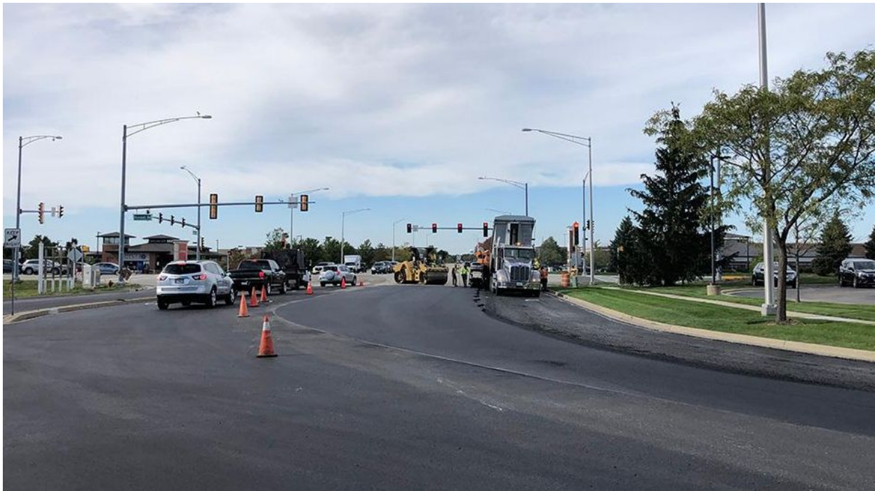
Surface asphalt placement on Harnish Drive

Last week, the contractor completed placement of the asphalt surface course - the top layer of the driving surface which provides a smooth driving experience - as well as permanent pavement markings.