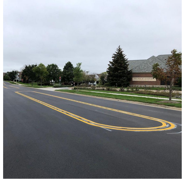
New asphalt surface and permanent pavement markings