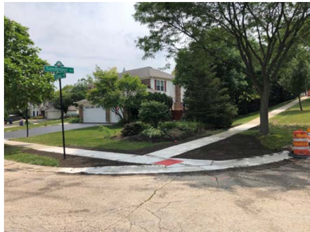
Topsoil placement around new sidewalks

This week, project activities included removing trees, survey layout and saw-cutting pavement that allowed crews to begin installing new storm sewer infrastructure. In addition, manholes and storm inlets were delivered, and crews began landscape restoration work with topsoil around the new sidewalks.