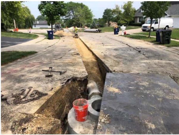
New storm sewer infrastructure installation